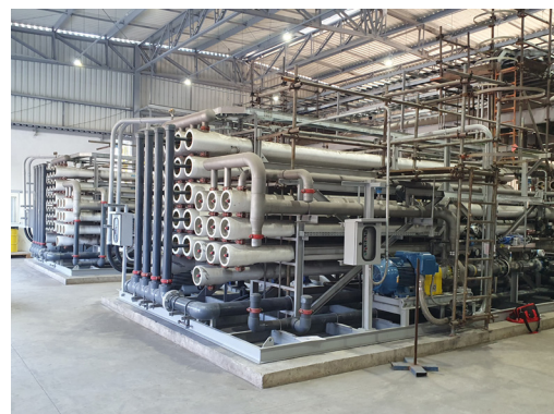
Figure 4: RO skids