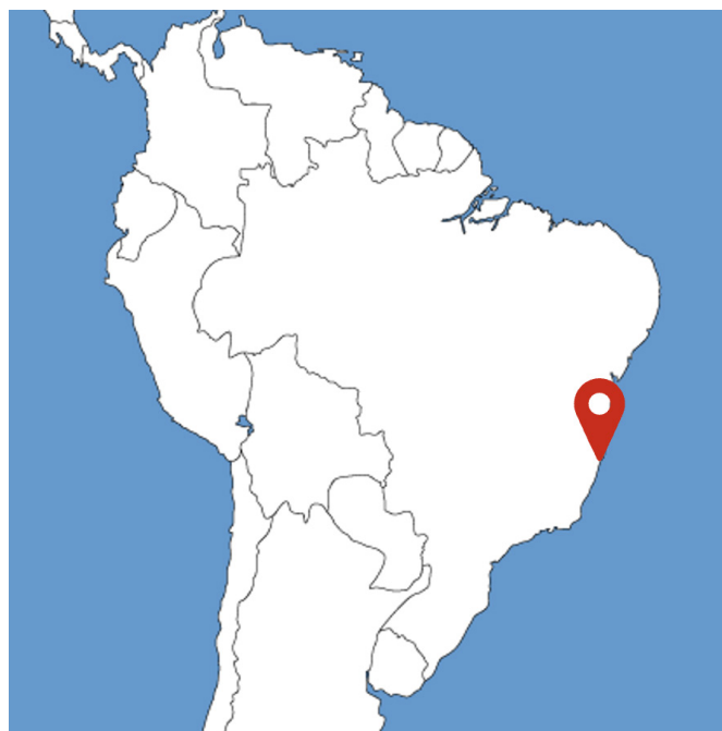
Figure 1: Image ArcelorMittal Tubarão