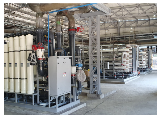
Figure 5: Plant Overview