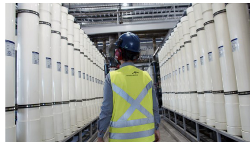
Figure 3: UF skids