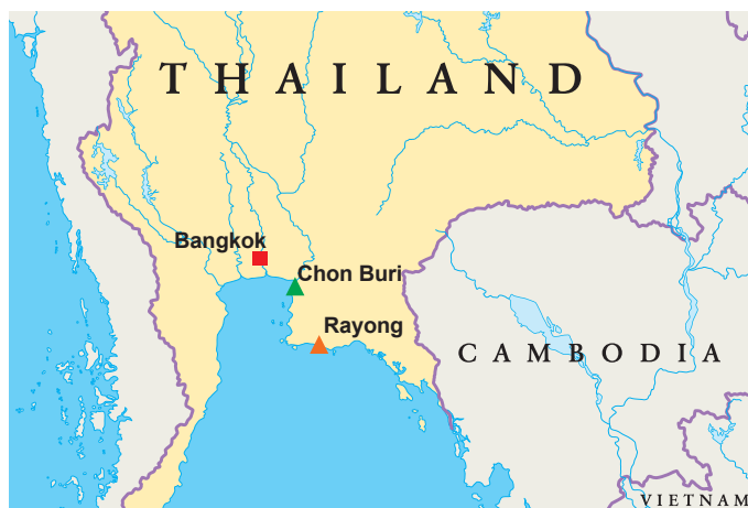
Figure 1: Plant locations in Thailand

For two-thirds of all wastewater, the WTP's at AMATA uses Sequencing Batch Reactors with Biological Aerated Filtration technology, while the remaining water is treated via conventional