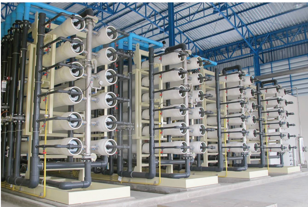
Figure 3: RO skid

By using Toray's low-fouling polyamide composite membranes, the WTPs at the AMATA estates operated the RO systems for more than five years before requiring replacement of the RO elements. This low rate of replacement has considerably helped the end-user save operational and capital costs and is noted as one of the most successful wastewater reuse plants in Thailand.