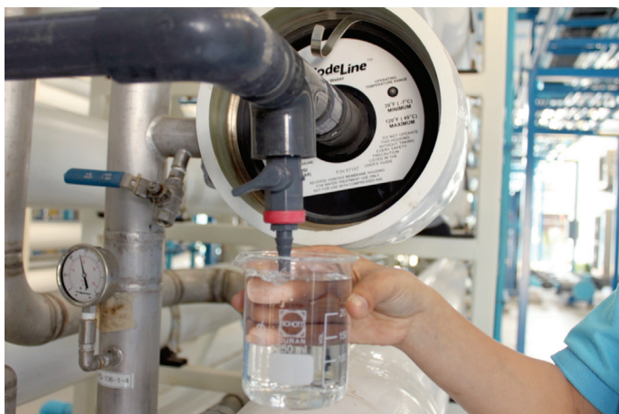
Figure 2: RO permeate

activated sludge. Seventy percent of this tertiary wastewater is treated by ultrafiltration (UF) to reduce turbidity, followed by ROMEMBRA™ low-fouling RO membrane to reduce total dissolved solids (TDS) before being resupplied to nearby factories. The remaining thirty percent of the treated wastewater is used in the estates for irrigation of common areas and golf courses, and for cooling processes at the Amata B. Grimm power plants.