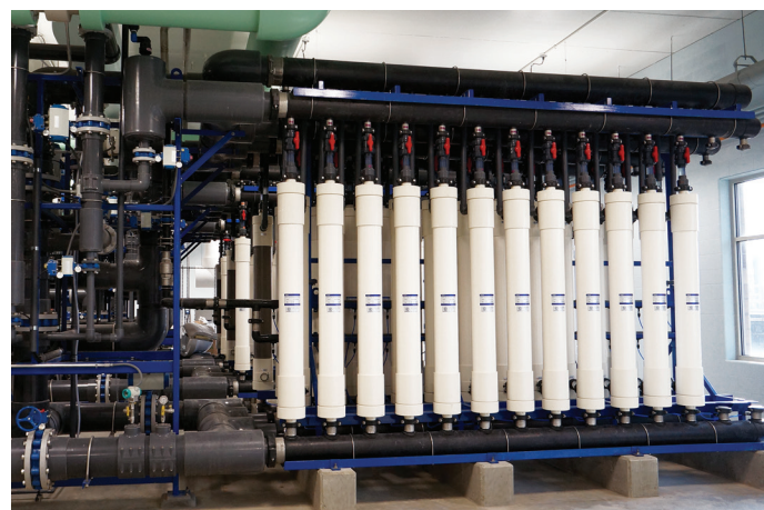
Figure 2: UF system designed and constructed by H2O Innovation, Inc. ( www.h2oinnovation.com )

Upon completion of the pilot, the membranes were further evaluated against non-monetary factors. A decision matrix chart (Table 2) helped determine the best UF system for the City, where Toray scored the most points and recommended for the WTP's improvement plans.