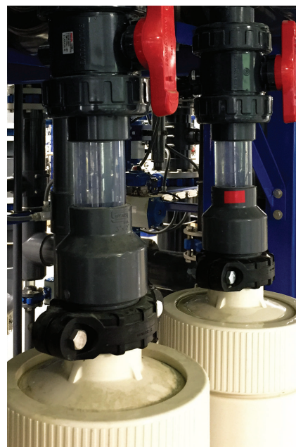
Figure 3: filtrate site tubes

Cook, Jeremy. "Design and Permitting of UF/NF System with Surface Water and Groundwater Supplies." 2013 Membrane Technology Conference & Exposition. San Antonio, TX. February 2013.