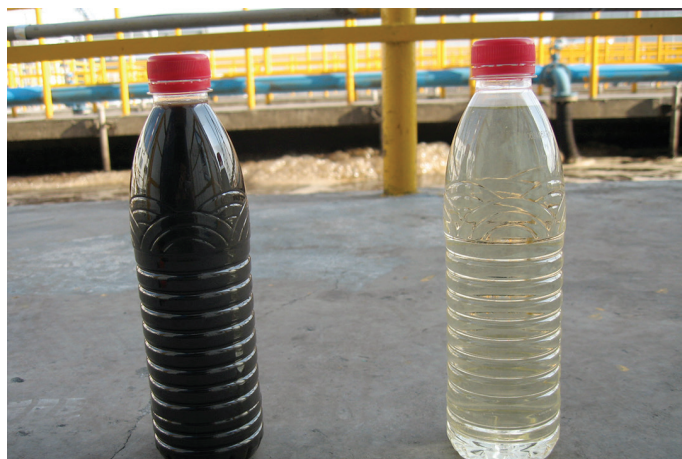
Figure 5: Water quality comparison – wastewater on the left and MBR effluent on the right

The raw water quality also experienced spikes in TDS, excessive oil, and sludge concentrations. However, Toray's MEMBRAY™ modules continued to operate stably and avoided shutdowns by means of process adjustment, chemical cleaning, and other maintenance procedures.