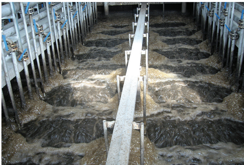
Figure 1: MBR tank at Ordos Coal-to-Liquid Facility

For piloting purposes, the consultant examined several membrane bioreactor (MBR) modules in both hollow-fiber and flat-sheet configurations. Test results indicated that none of the hollow-fiber modules could meet the requirements, while Toray's flat-sheet MEMBRAY™ MBR module performed most reliably. MEMBRAY™ features a highly durable PVDF (polyvinylidene fluoride) material with improved resistance against chemicals and physical durability during air scouring. Its membrane pores are uniformly and densely distributed along the membrane surface, which increases permeability and reduces the build-up of foulants. Toray was selected according to these product