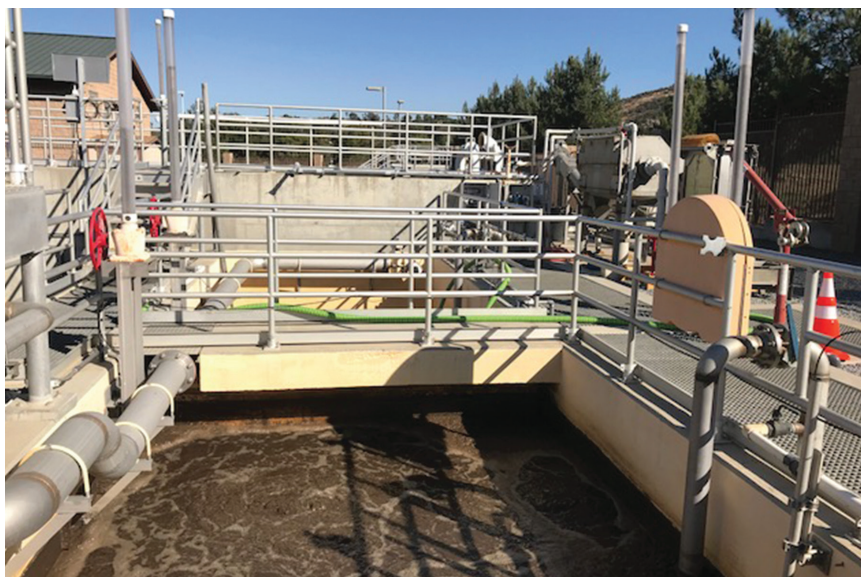
Table 1 — Combined savings at Valley Center

Total projected annual savings with membrane thickening processor using MEMBRAY™