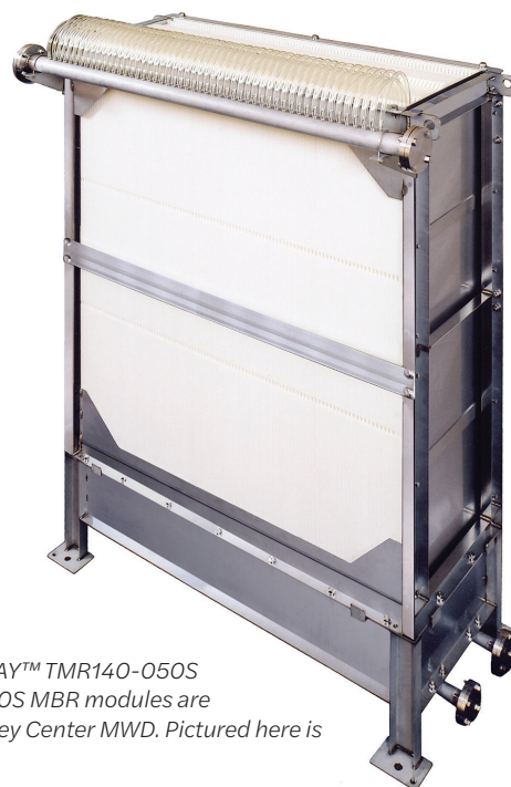
Toray's MEMBRAY™ TMR140-050S and TMR140-100S MBR modules are operating at Valley Center MWD. Pictured here is TMR140-100S.