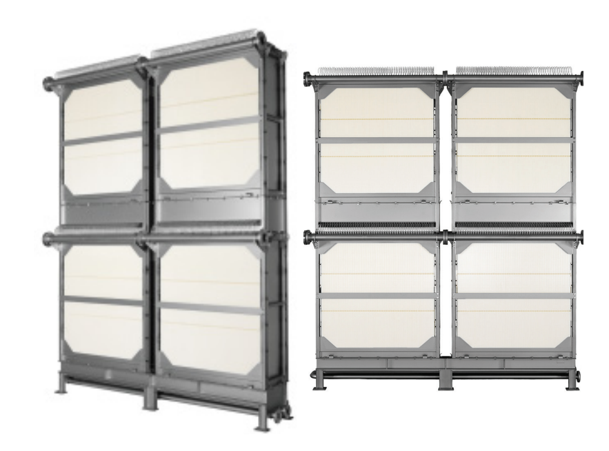
Figure 4:TMR140-400DW MBR module by Toray featuring four element blocks in a double-deck arrangement