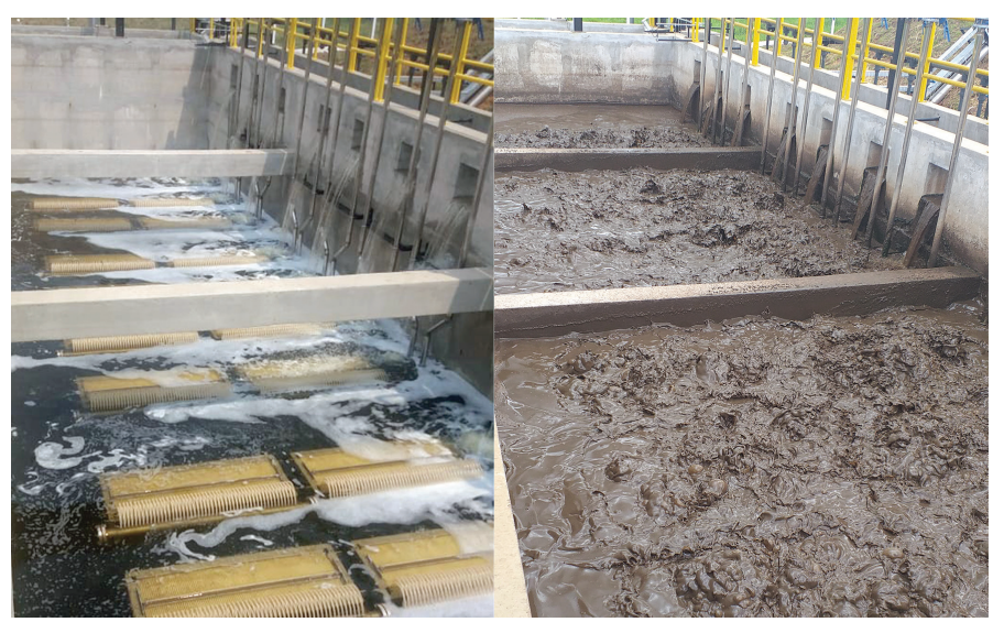
Figure 1(top):one train MBR tank containing 10 Toray MBR modules Figure 2(bottom): before and after operation of MBR tank