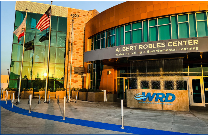
Figure 1: Albert Robles Center

Process design features focused on achieving the smallest footprint and lowest capital and operation costs, particularly energy. As a result, a direct coupling of UF to a first and second stage primary RO feeding and a third stage secondary RO for concentrate recovery is in place. The direct coupling, the method of feeding the UF filtrate directly to the RO, eliminates the need for a break tank and associated equipment to store the UF filtrate/RO feedwater. Historically, this type of arrangement reduces the risk of biological growth within the break tank, thus reducing the RO system's contamination risk in seawater desalination systems. However, as wastewater sources may contain high levels of organics, this design was essential in energy savings from the reduced footprint.