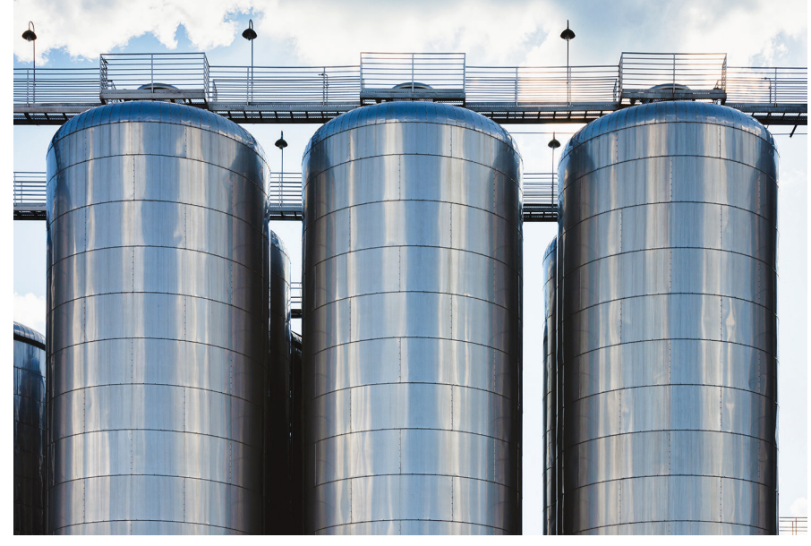
Figure 1: Fermentation tanks

Lagunitas integrated reuse into the wastewater treatment design using Toray's membrane bioreactor (MBR) and reverse osmosis (RO) membrane technologies. Toray's flat-sheet MBR module removes 99% of contaminants sending the filtrate to RO