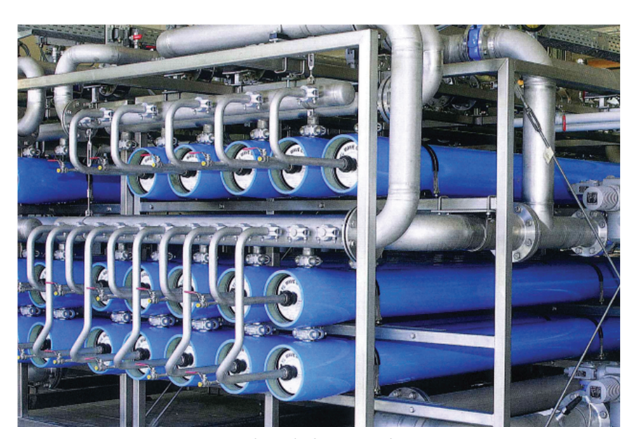
Figure 1: Low-pressure RO system at Löhnen drinking water plant