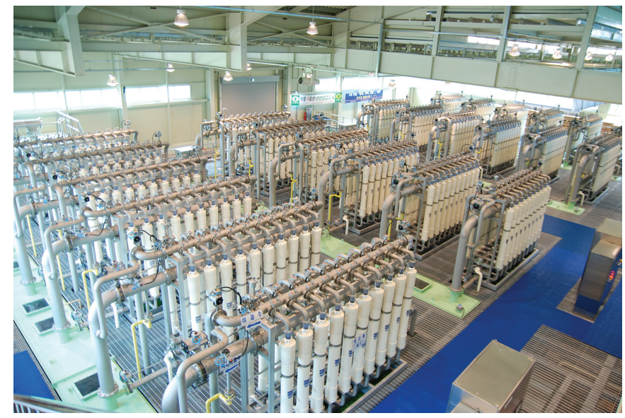
Figure 1: UF membrane system at Gongju WTP

The feed water is lake/pond water collected from the Daecheong Dam and has an average of 1.5 NTU turbidity, with the highest being 12.1 NTU. Furthermore, this surface water experiences spikes in taste and odor during summer and autumn due to fluctuations in algae and other odor inducers. The membrane filtration process aimed to reduce turbidity and pathogenic micro-organisms despite the temporary occurrence of taste and odor problems.