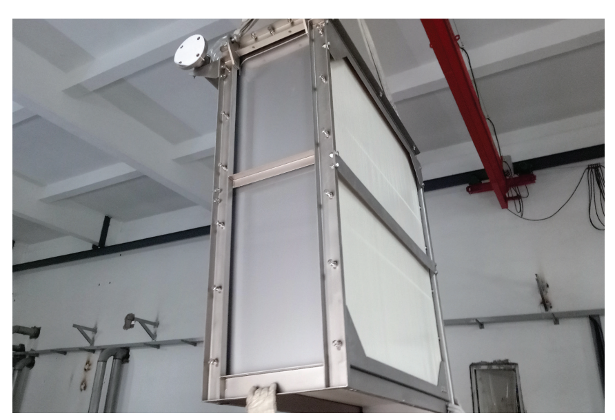
Figure 3: Installation of Toray MBR modules