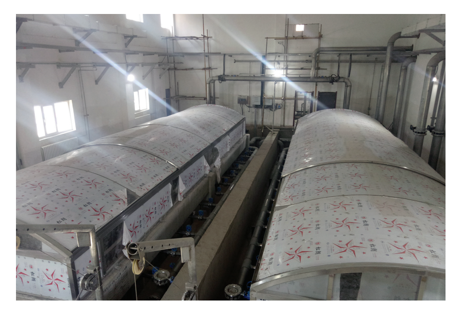
Figure 1: Tanks installed with Toray MBR modules at Lanzhou's bio-pharmaceutical facility