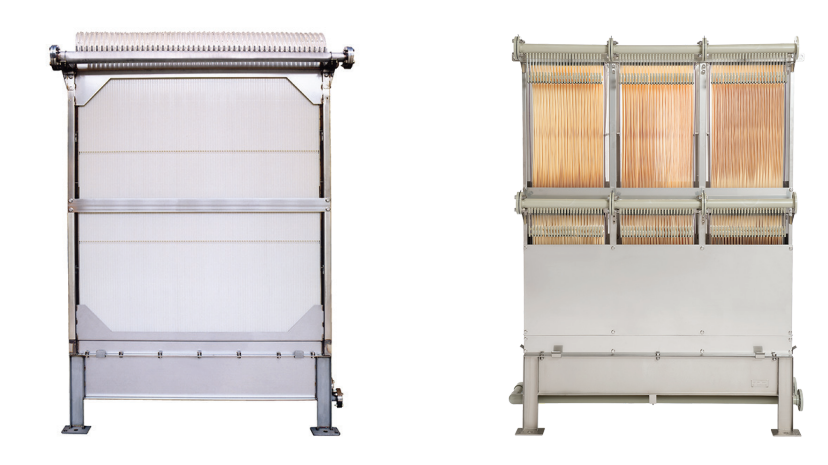
Figure 5: Toray flat-plate and flat-sheet MBR Modules