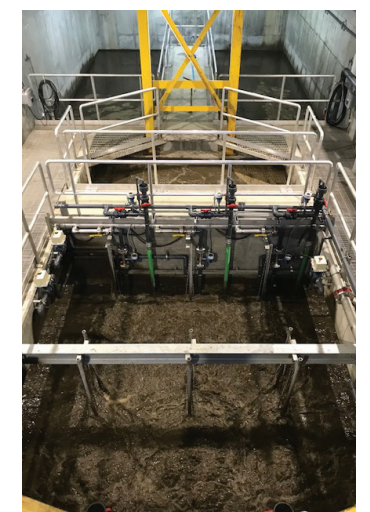
Figures 2 & 3: Operation of NHP210-300S at Arbutus Ridge