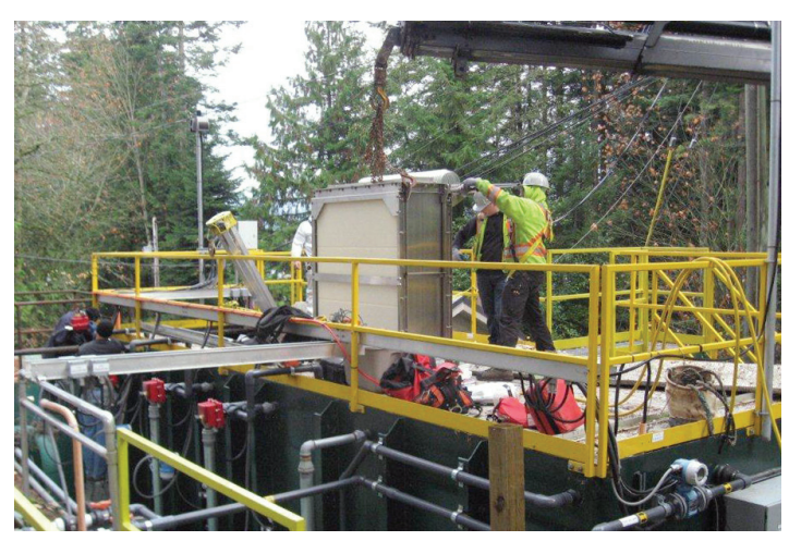
Figure 1: Installation of original Toray MBR