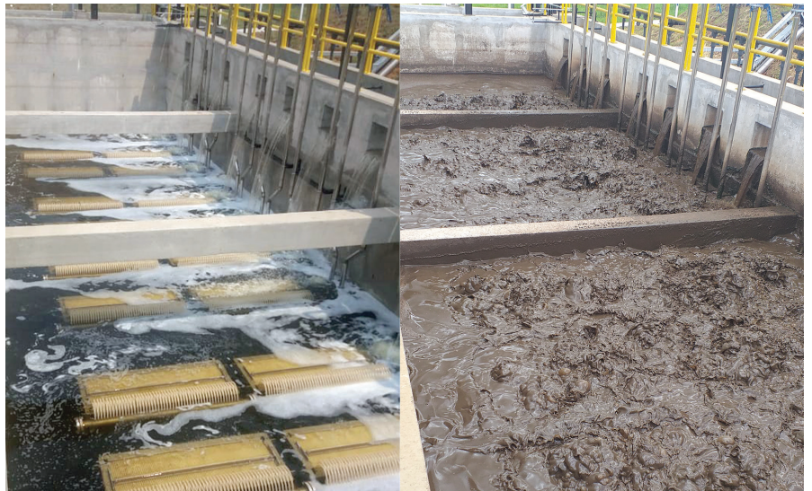
Figure 1(top):one train MBR tank containing 10 Toray MBR modules