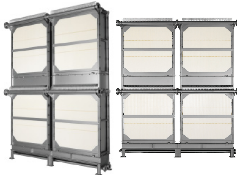
Figure 4: TMR140-400DW MBR module by Toray featuring four element blocks in a double-deck arrangement