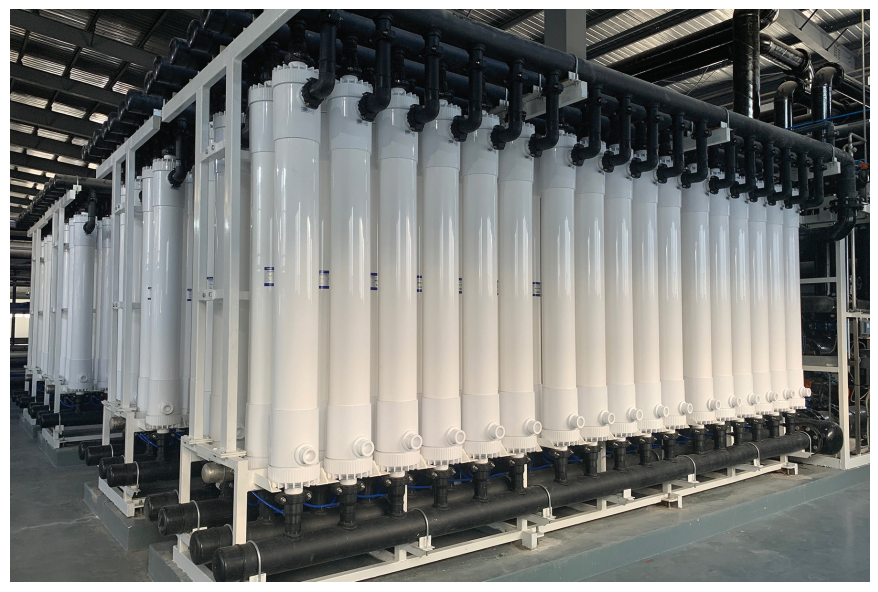
Figure 1: UF system at Wuxi installed with Toray HFUG-2020AN UF modules

However, due to limited footprint and the requirement to reduce suspended solids, the EPC contractor for Wuxi WRP, GreenTech Environmental Co., Ltd (GreenTech), evaluated ultrafiltration (UF) membrane technology the most effective treatment of the industrial wastewater, as illustrated in Figure 2.