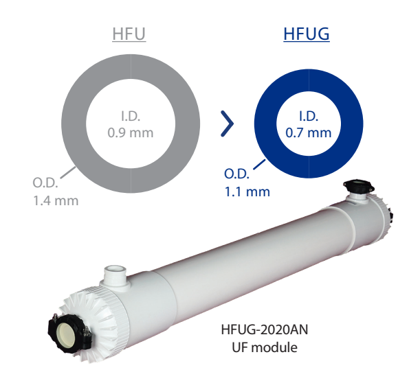
Figure 3: UF hollow-fiber diameter comparison

Toray's UF membranes, valued for their membrane durability, low-fouling, and high flux rates, continue to operate stably and efficiently, helping the Wuxi WRP meet stringent wastewater discharge requirements.